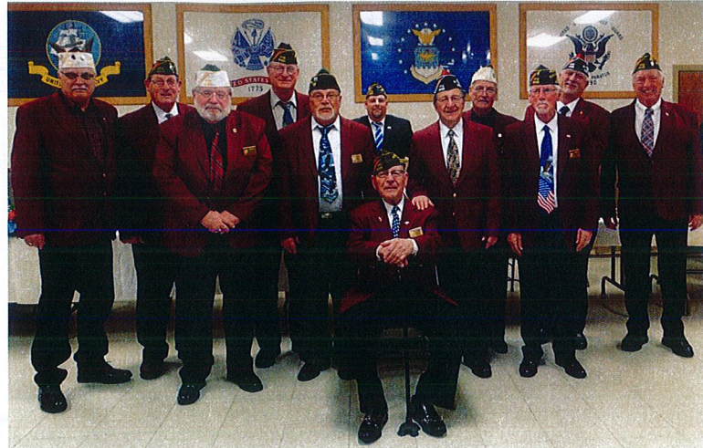
Past Commanders Representing at the Post Anniversary Dinner